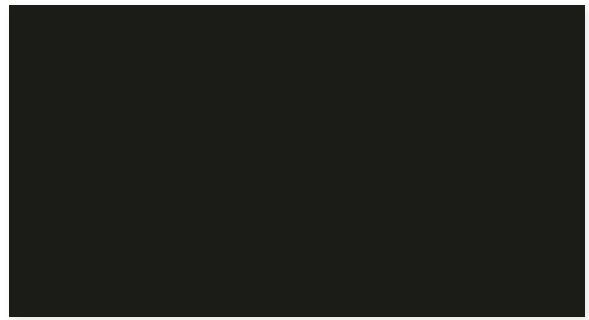
CLASS I DARK BRONZE