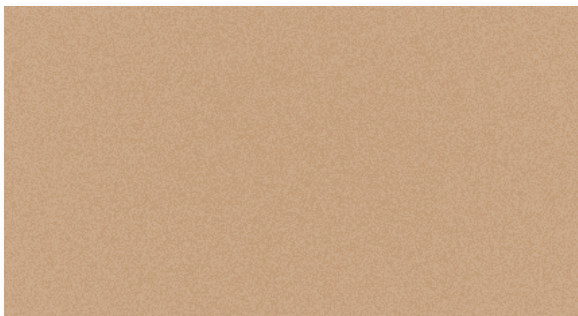
CLASS I LIGHT BRONZE

Fleetwood offers two custom anodized colors: